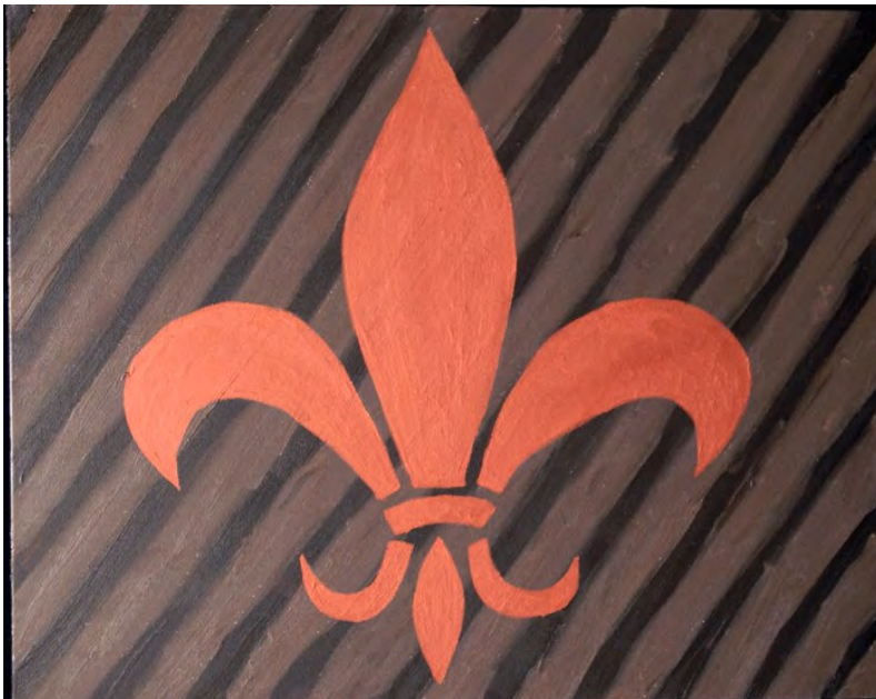
LINDSAY LEBLANC, RN, oil on canvas Value: $350