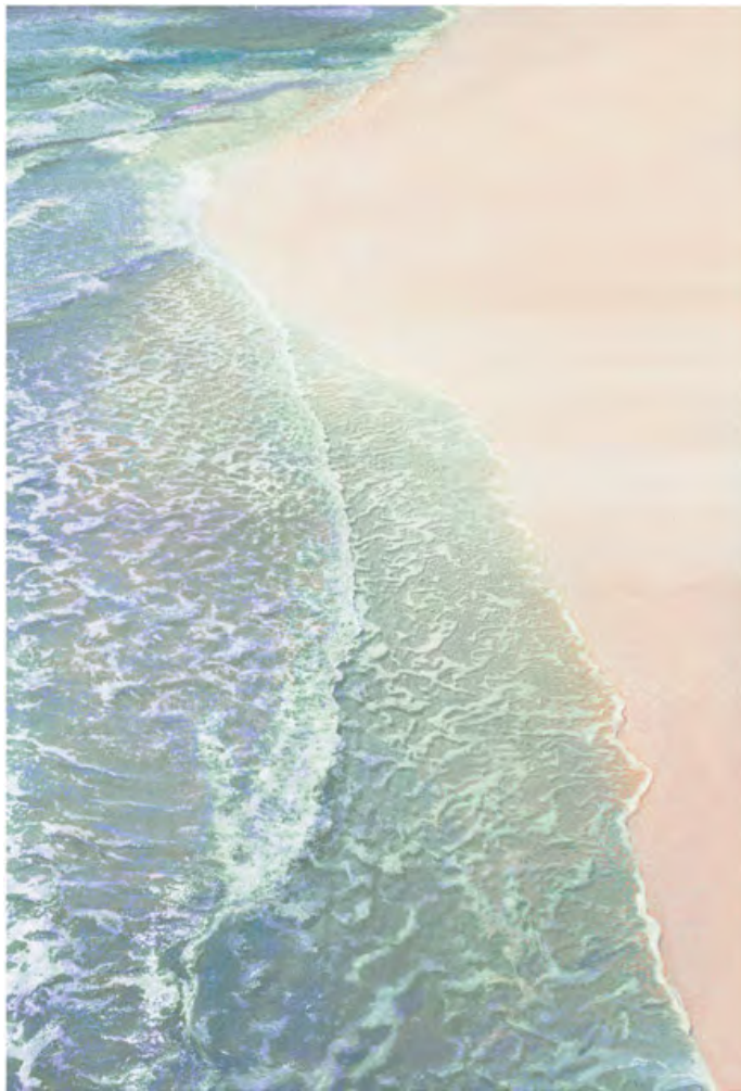
EMERY CLARK, mixed media "Waters Edge" 36" x 48" Value: $4,500 Minimum Bid: $800