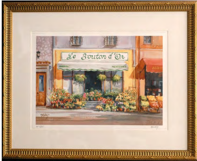
PETER BRIANT, signed and framed giclee "Le Bouton d'Or" Value: $500