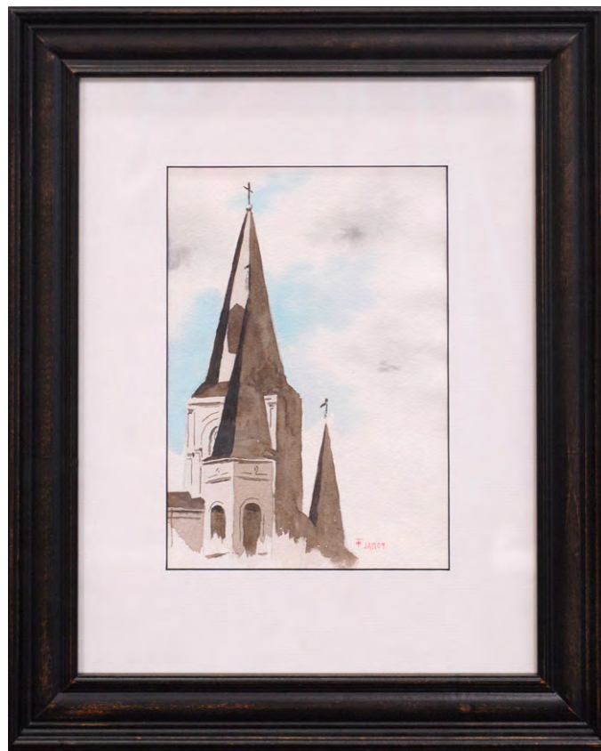
ODIE K. TUCKER, framed watercolor "St. Louis Spires" Courtesy of Odie K. Tucker Watercolors Value: $200