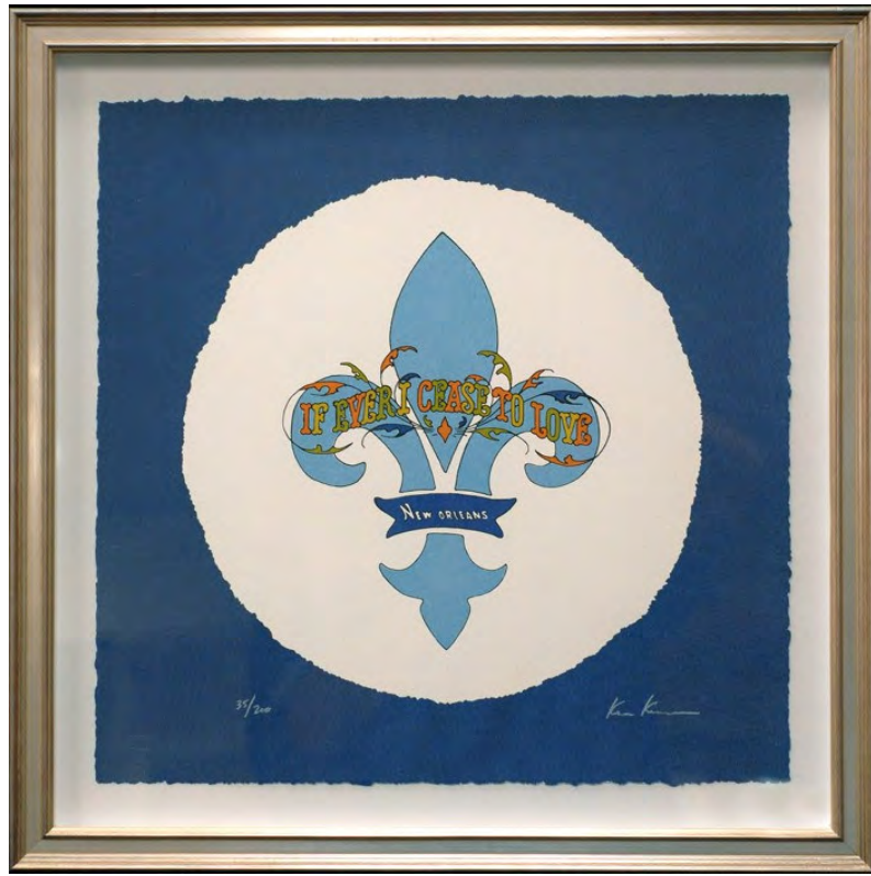
KEN KENAN, original hand-signed silkscreen “Fleur de New Orleans” Courtesy of Naham Fine Art & Framing Value: $350