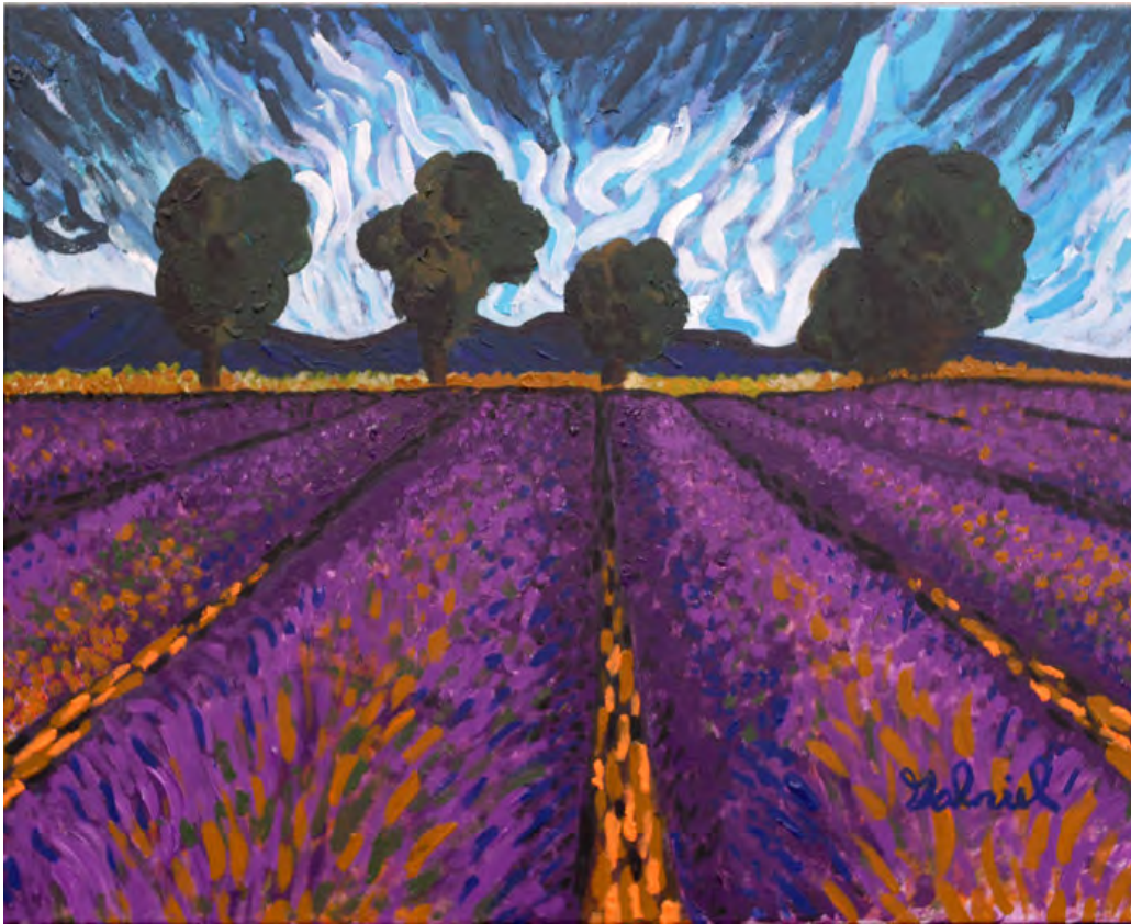
GABE BUNDICK, acrylic on canvas "Fields of Lavender" Value: $400