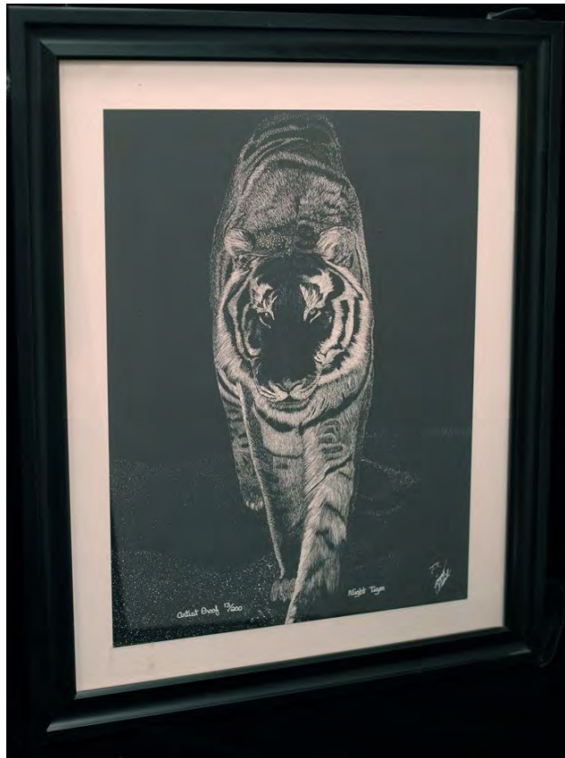
JIMMY THERIOT, framed artist proof scratchboard "Night Tiger" Value: To Be Determined