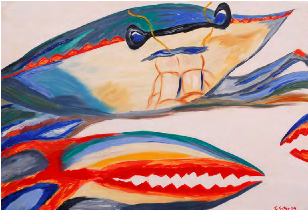
ERICA FOSTER, oil on canvas Value: $250