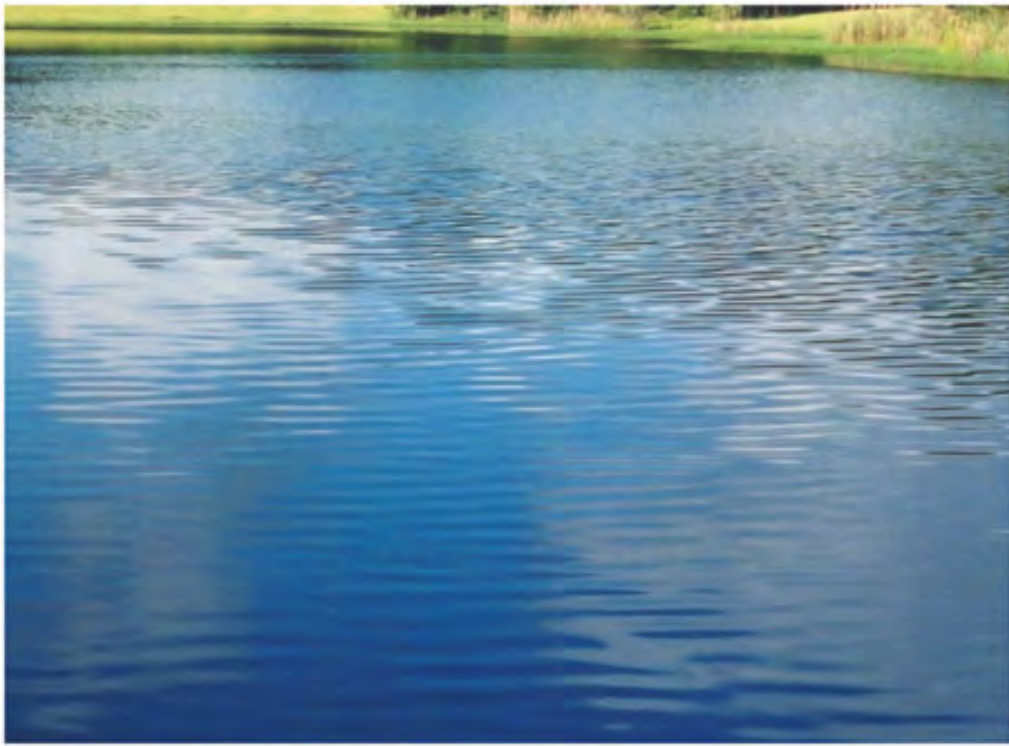
JOSH MILTON, mixed media "Norwood Reflections" Value: To Be Determined