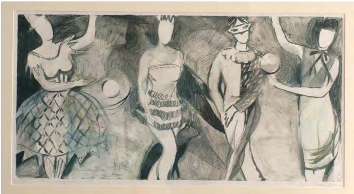
NANCY DAWES, signed and framed monoprint with charcoal Value: $1,800 Minimum Bid: To Be Determined