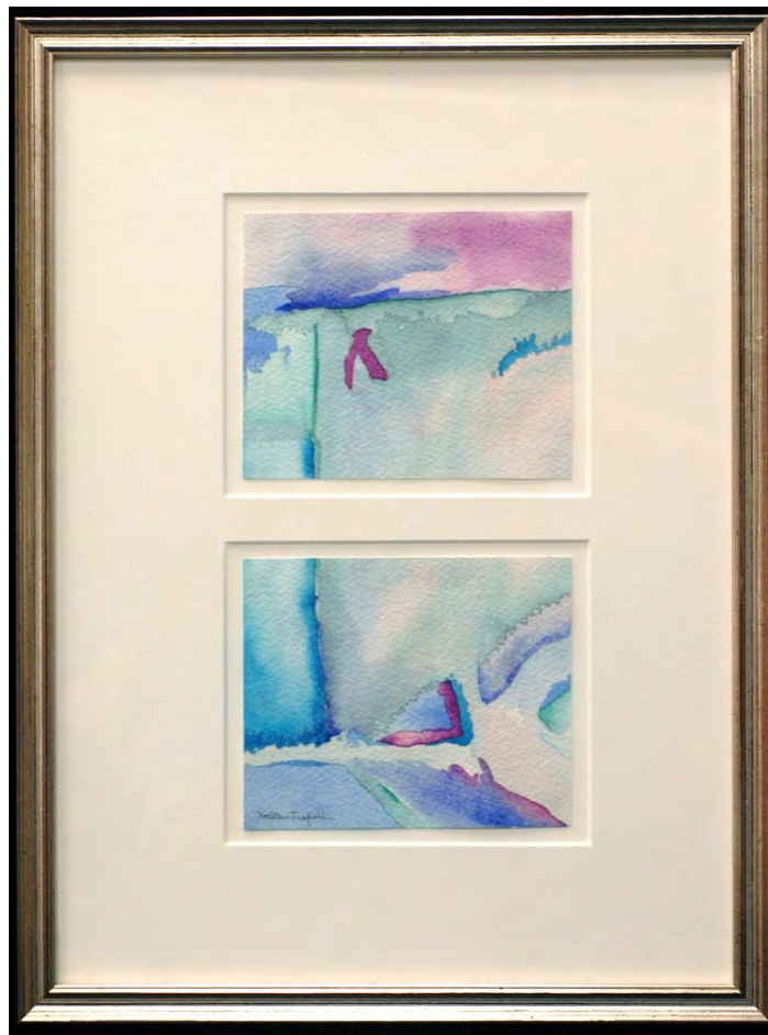
KATHLEEN TRAPOLIN, framed abstract watercolor diptych Value: $350