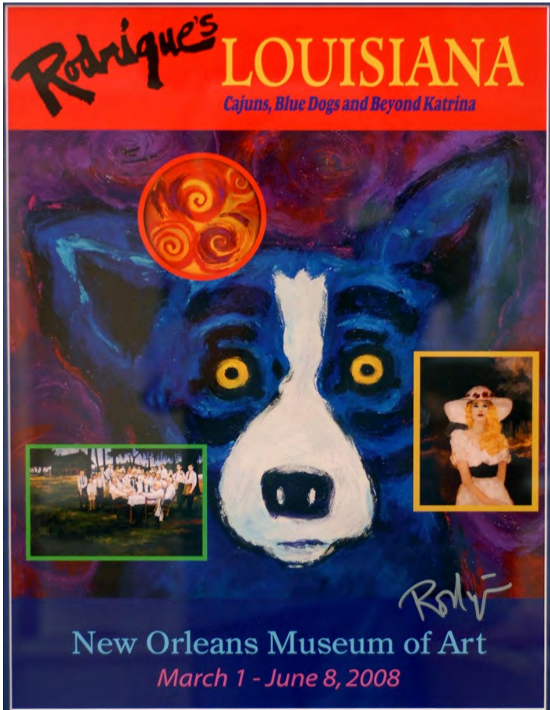
GEORGE RODRIGUE, signed and framed NOMA poster Value: To be Determined Minimum Bid: To Be Determined