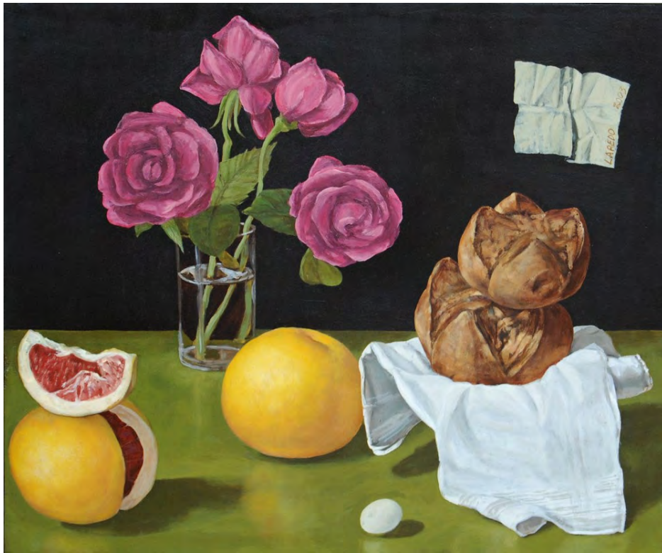
JUAN LAREDO, oil on canvas “Still Life with Grapefruit, Bread, Roses & Bantam Eggs” Courtesy of Cole Pratt Gallery Value: $3,200 Minimum Bid: To Be Determined