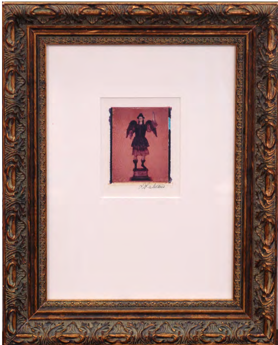
DEBBIE RUBIANO, framed Polaroid photo transfer "Angel at Cartagena" Value: $175