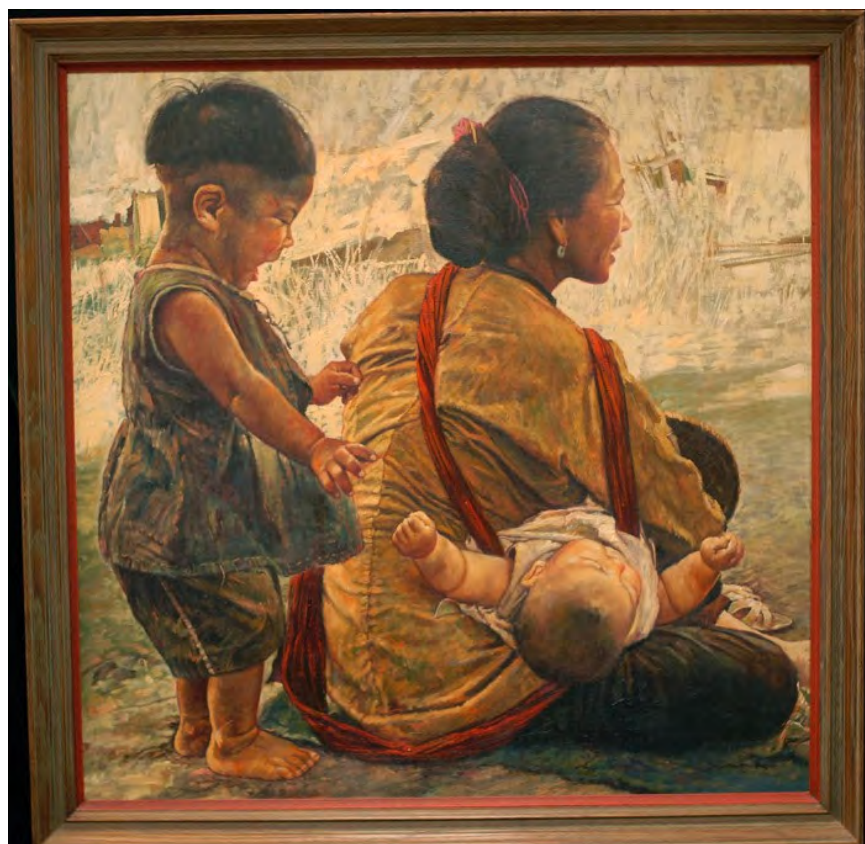
WAI MING, oil on canvas "Love" Value: $18,000 Minimum Bid: To Be Determined LIVE AUCTION ITEM