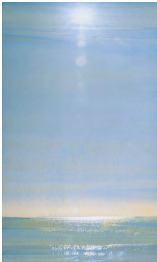
EMERY CLARK, mixed media "Calm after the Storm" 16" x 20" Value: $1,500 Minimum Bid: $400