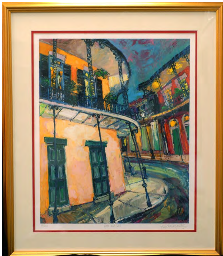
JAMES MICHALOPOULOS, limited-edition serigraph "Beck and Call" Value: $500