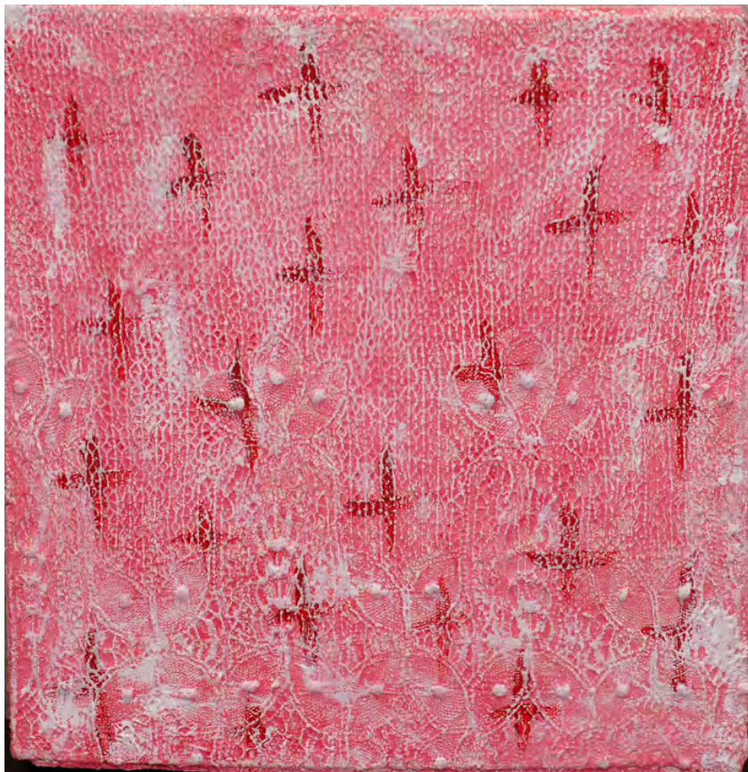
JEANNIE OSBORNE, mixed media "Christening" Value: $250