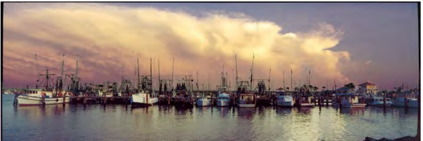
STEPHEN LEGENDRE, manipulated panoramic photograph giclee Pass Christian Harbor July 2005 Value: $250