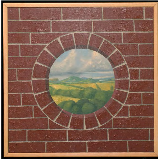
ALAN GERSON, oil on board "Wreath XIV" Courtesy of LeMieux Galleries Value: $2,500 Minimum Bid: $500