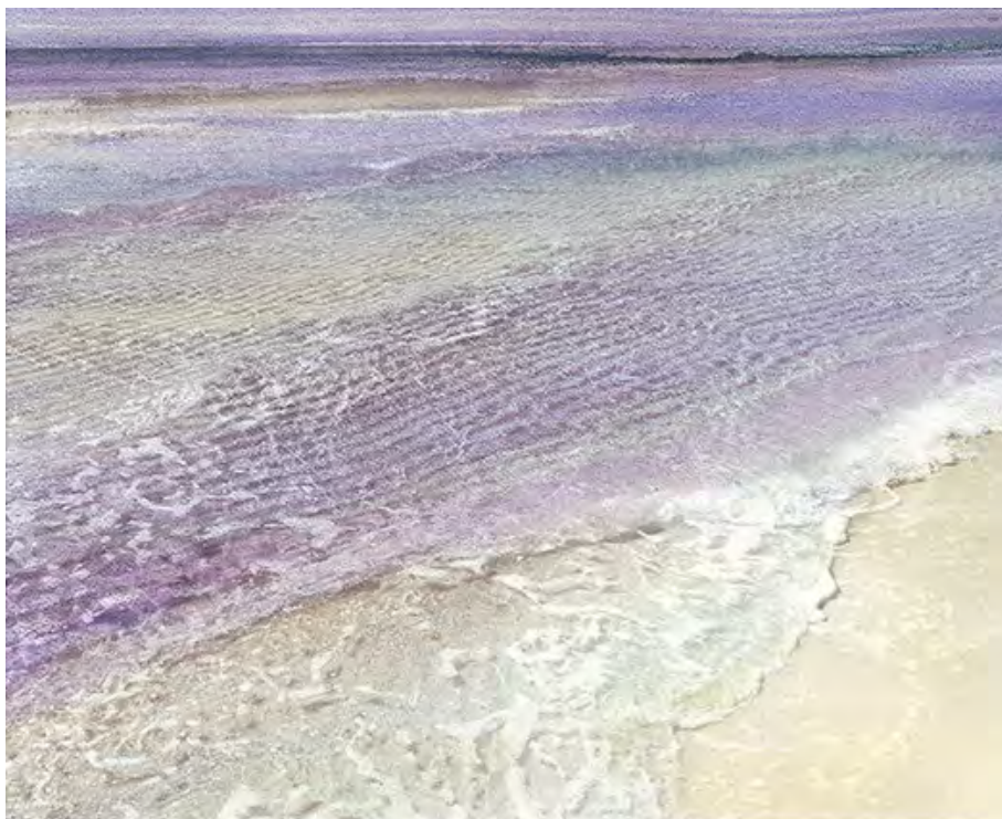
EMERY CLARK, mixed media "Morning Tide" 14" x 20" Value: $1,200 Minimum Bid: $350