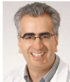
MEET THE DOCTOR

"Donating an organ is an important decision, and the