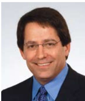
MEET THE DOCTOR