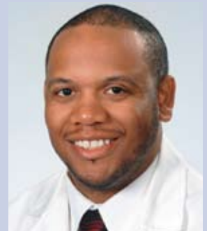
MEET THE DOCTOR

Plus, don't use bad judgement, such as poor eating habits or not following up with chronic conditions, in order to deal with the stress of the economic downturn. Saving money on the front end will cost you more on the back end. We can't afford to take our health for granted.