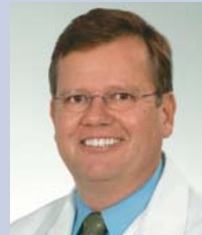
MEET THE DOCTOR

Emergency rooms are busier than usual on Halloween. When it falls on the weekend, as it does this year, the wait can be even longer. Before you head to an Ochsner ER, check ochsner.org/time to see how long the wait is. Wait times are updated in real time.